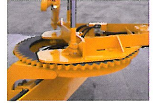
53" gear driven circle with "A" frame allows 360° blade rotation