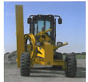
90° Bank slope saddle