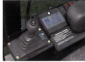
Full power shift transmission with torque converter