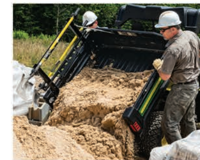
Cargo lift power dump kits for the heaviest of jobs, starting at just $899.