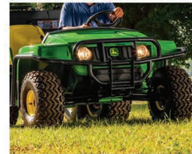
Front bumpers and brush guards, starting at just $199.