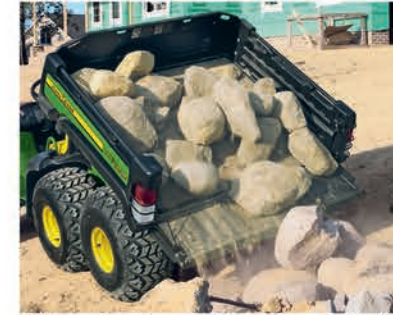
With payload capacities up to 1,600 lb, these beds are made to work.