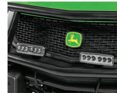
LED headlights and work lights for working late, starting at just $199.