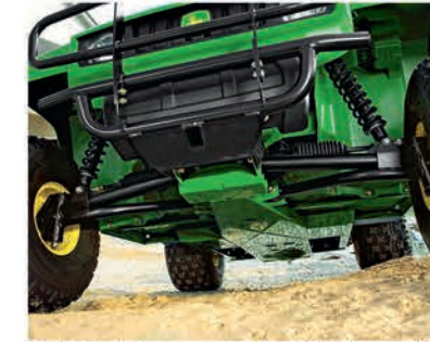
Rack & pinion steering and independent suspension make steering easy & smooth.