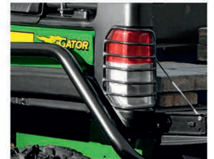
Fender guards and tail light protectors, starting at just $119.