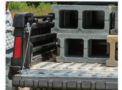
A generous 16.4 cu. ft. cargo box with bedliner can make light work of any job.