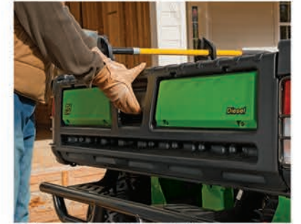
Pick-up style tailgates fold out to 90 degrees and down to a full 150 degrees.