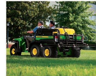
Endless applications for one of the most versatile pieces of equipment on your land.