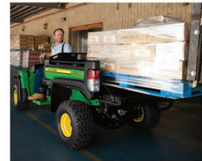
Cargo boxes as wide as 52 in. even make hauling pallets a breeze.