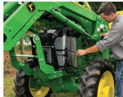
Easy maintenance made easier with removable radiator screens.