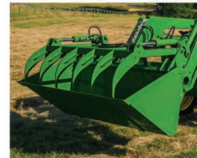
Add a 3rd SCV to your loader valves for extra capability, starting at just $1,499.