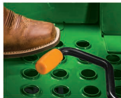
Foot-controlled throttle control levers for those quick bursts of additional power.