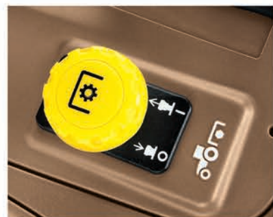
Advanced, independent PTO engagement while moving increases production.