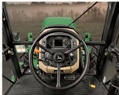
Sloped hood design gives you the visibility you need for front loader work.