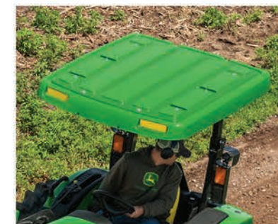
Canopy kits to keep you cool and in the shade, starting at just $599.

Ask about our Extended Warranty Protection Plans, starting at just $599!