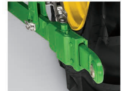
Add telescopic draft links to your three-point hitch, starting at just $799.