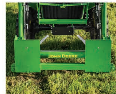
Skid steer attachment carrier, starting at just $1,199.