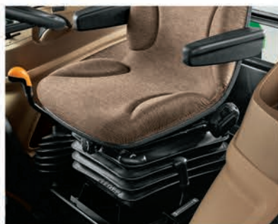
Smoother rides, flatter platforms, better cushions and optional air-ride seats.