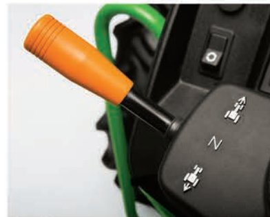
PowrReverser transmissions make loader work quick and clutchless.