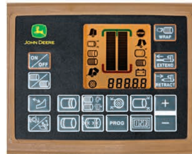
Bale Trak Pro™ monitors make on-the-go adjustments fast & simple.