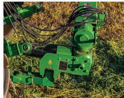
Now available on select models, a drawbar swivel hitch.