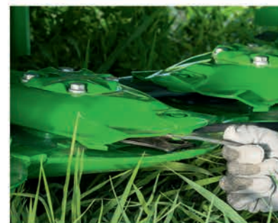
Quick change knives and modular, replaceable shear hubs make field repairs easy.