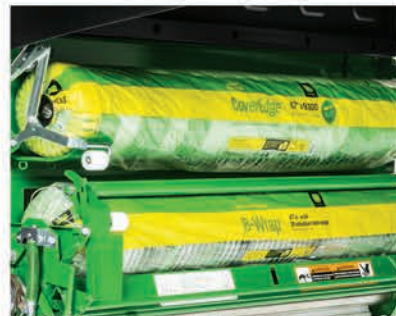
A bale is only as good as what wraps it, and CoverEdge™ net wrap is as good as it gets.