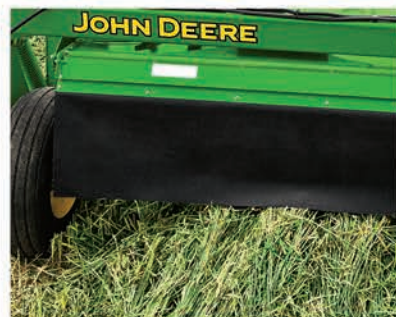
V-tine impellers, urethane & steel rollers all condition hay for quicker dry times.