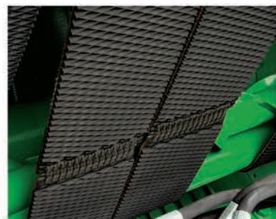
DiamondTough™ triple-weave baler belts provide the strongest reliability available.