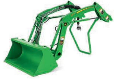
FRONT LOADERS with lift capacities from 553 lb to 2,539 lb