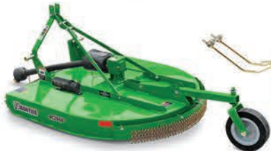
ROTARY CUTTERS from 4 ft. to 20 ft.