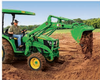
Toothbars to make them dig faster starting at just $299.