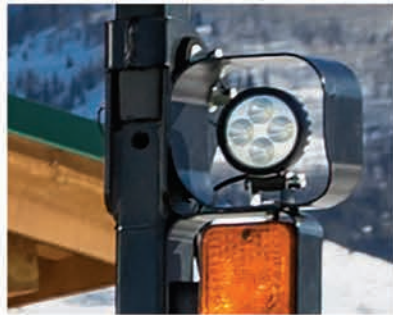
Extra rear and front work lights for working late, starting at just $99.