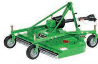
REAR GROOMING MOWERS from 4 ft. to 8.5 ft.