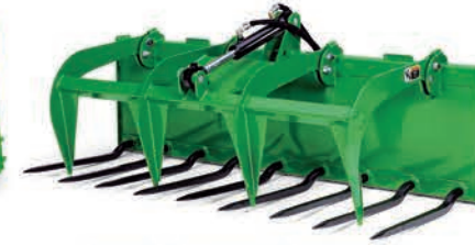
ROOT & MANURE GRAPPLES from 53 in. to 96 in.