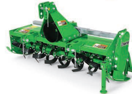
ROTARY TILLERS from 42 in. to 121 in.