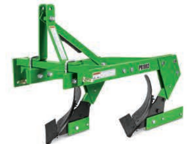
TURNING PLOWS one- and two-bottom