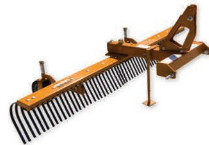
LANDSCAPE RAKES from 4 ft. to 8 ft.