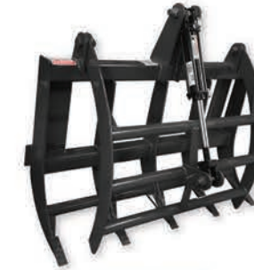
ROOT RAKES from 48 in. to 96 in.