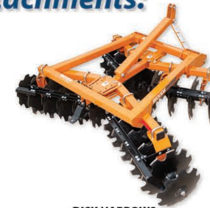
DISK HARROWS from 4 ft. to 15 ft.