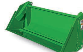
4-IN-1 BUCKETS from 53 in. to 84 in.