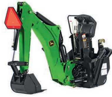
BACKHOES digging depths from 74 in. to 103 in.