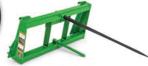
BALE SPEARS single & multiple tines