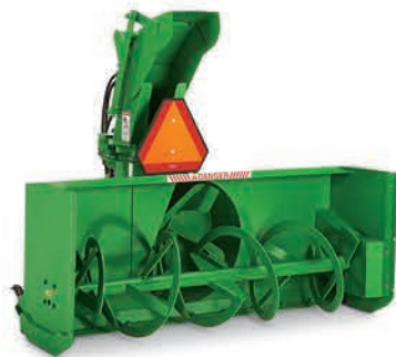
SNOW BLOWERS from 4 ft. to 9 ft.