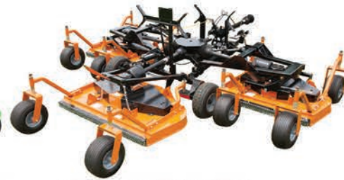
BATWING TURF MOWERS from 12 ft. to 17 ft.