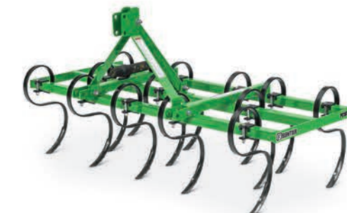
ROW & FIELD CULTIVATORS one-row and 72 in. field