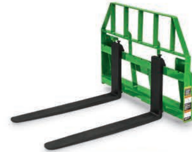
PALLET FORKS from 36 in. to 48 in.