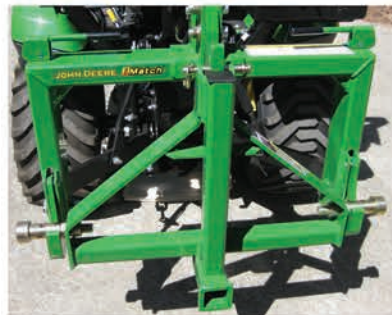
3-point tractor receiver hitches make moving trailers easy, starting at just $149.