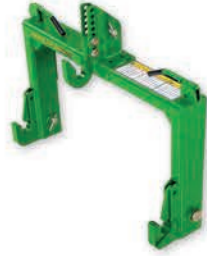
IMATCH™ QUICK HITCHES make attaching implements easy