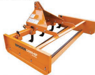
GRADING SCAPERS/LAND PLANES from 4 ft. to 10 ft.