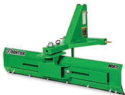
REAR BLADES from 4 ft. to 10 ft.