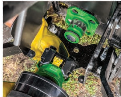
Quik Knect™ PTO receivers for easy PTO connections, starting at just $199.