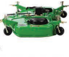
MID-MOUNT MOWERS from 54 in. to 72 in.