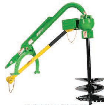
POST HOLE DIGGERS from 6 in. to 30 in..