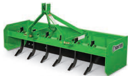
BOX BLADES from 4 ft. to 8 ft.