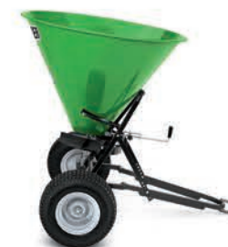
FERTILIZER SPREADERS from 226 lb to 2,205 lb