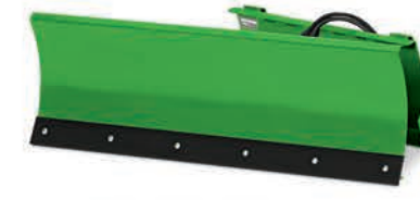
FRONT BLADES from 60 in. to 120 in.