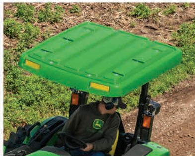
Canopy kits to keep you cool and in the shade, starting at just $499.