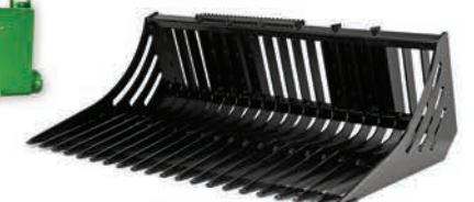
ROCK BUCKETS from 53 in. to 96 in.