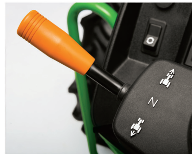
PowrReverser™ transmissions make loader work quick and clutchless.