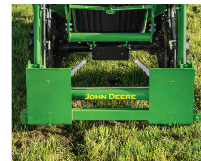
A skid steer attachment carrier expands your loader implement options.