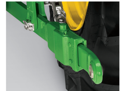
Make hooking-up to implements much easier with telescopic draft links.