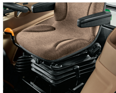
Smoother rides, flatter platforms, better cushions and optional air-ride seats.