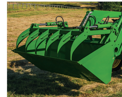
A 3rd SCV added to your loader valves gives you extra hydraulic capability.