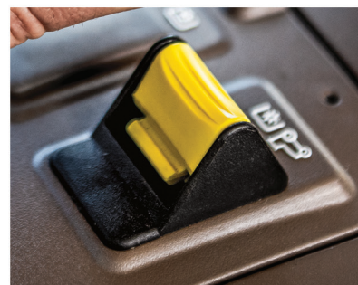
Advanced, independent PTO engagement while moving increases production.