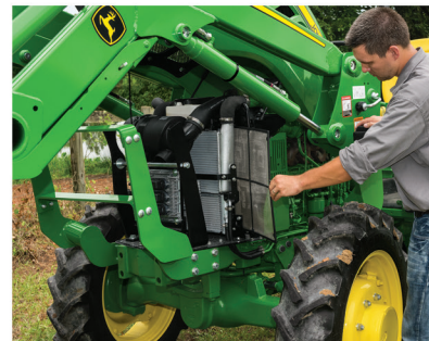
Easy maintenance made easier with removable radiator screens.