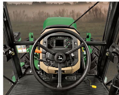
Sloped hood design gives you the visibility you need for front loader work.