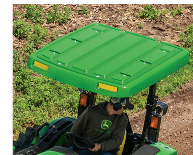
Canopy kits to keep you cool in the shade and block harsh sunlight.

Ask about our Extended Warranty Protection Plans, starting at just $699!