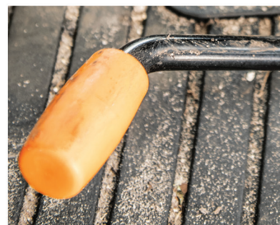
Foot-controlled throttle control levers for those quick bursts of additional power.